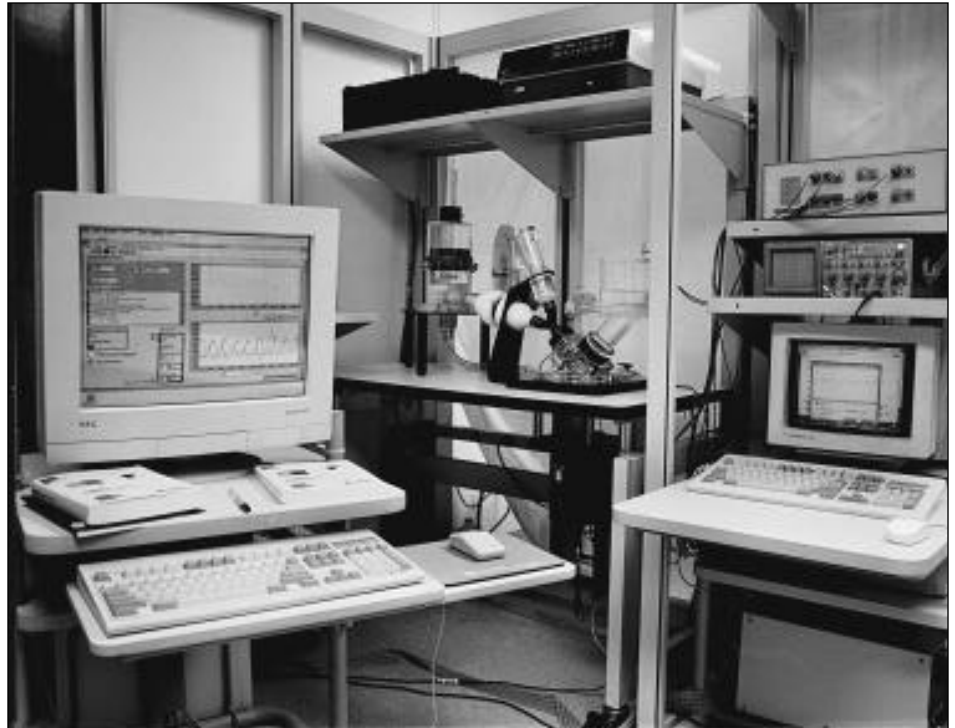
The electromechanical system formed by Structural Acoustics uses Windows-based LabVIEW and DAQ boards on a PC to perform an acoustic diagnostic procedure on prosthetic heart valves.

LabVIEW runs on the 486DX PC and acquires data while the system is pumping. The custom sensor interface takes care of signal conditioning. The sensor interface drives all of the sensors, amplifies their low-